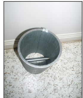
Locking Sleeve which is epoxyed into core drilled hole. Bollard locks onto bar.