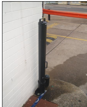
Bollard in storage stand