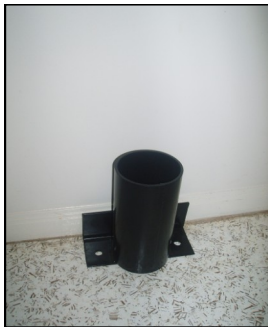
Storage stand for bollard when not in use